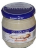
Chrzan - Horseradish Polonaise $2.99

Polish sauerkraut stew. Homemade - ready to eat. [Product Details...]